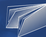
混合折 French Fold