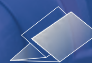
翻滚折 Parallel Opposite Folds