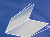
十字折 Cross Fold